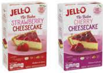
Jell-O No Bake Cheesecake Selected Vtys., 17.8 to 19.6-oz.