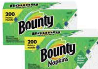
Bounty White Napkins 200-ct.