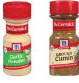
McCormick Spices or Extracts Selected Vtys., 12 to 4.12-oz.