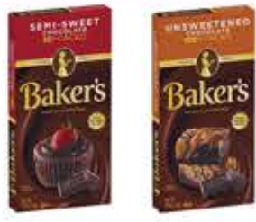
Baker's Chocolate Bars Selected Vtys., 4-oz.