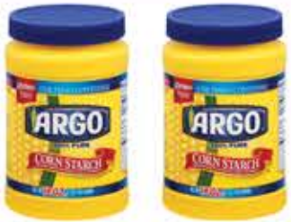
Argo Corn Starch 16-oz.