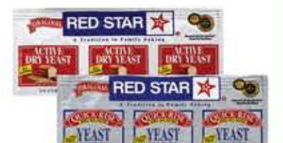
Red Star Yeast Selected Vtys., 3-ct.