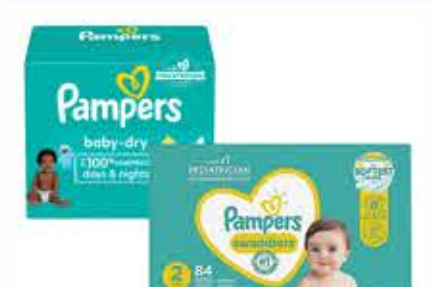
Pampers Diapers Selected Vtys., 44 to 96-ct.