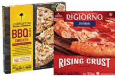
California Pizza Kitchen or DiGiorno Frozen Pizza Selected Vtys., 13.4 to 31.5-oz.