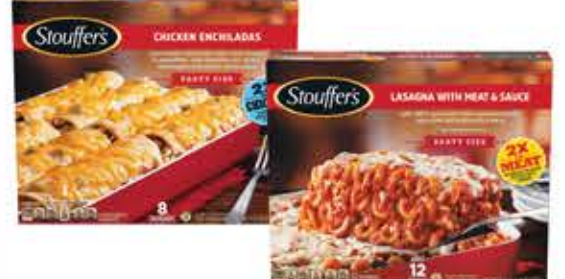
Stouffer's Party Size Entrées Selected Vtys., 57 to 96-oz., Frozen