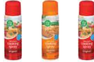
Food Club Non-Stick Cooking Spray Selected Vtys., 5 to 6-oz.