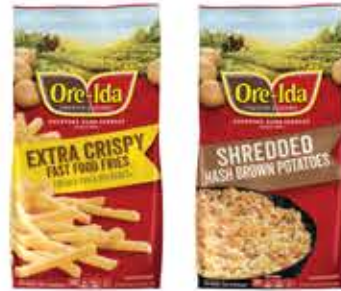
Ore-Ida Frozen Potatoes Selected Vtys., 19 to 32-oz.