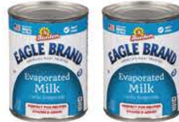
Eagle Brand Evaporated Milk 12-oz.