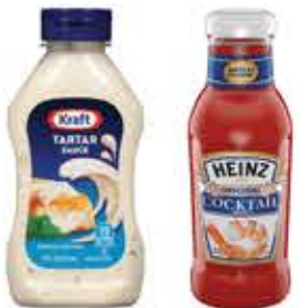
Kraft or Heinz Sauce Selected Vtys., 12-oz.