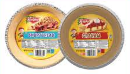
Keebler Pie Crusts Selected Vtys., 1 to 4-ct.