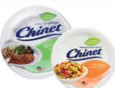
Chinet Paper Plates, Bowls or Trays Selected Vtys., 24 to 70-ct.