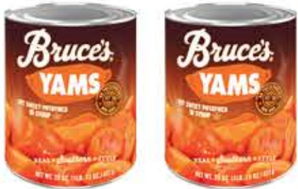
Bruce's Cut Yams 29-oz. In Syrup