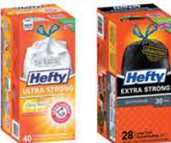
Hefty Trash Bags Selected Vtys., 28 to 45-ct.