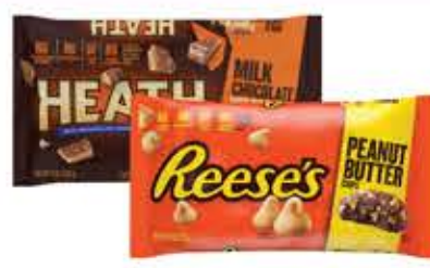
Hershey's Baking Chips Selected Vtys., 8 to 12-oz.