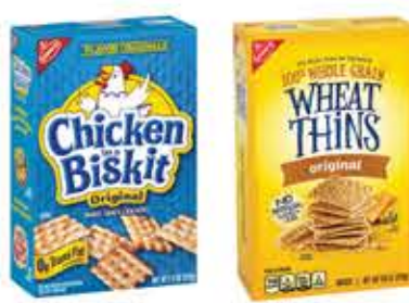
Nabisco Snack Crackers Selected Vtys., 6.5 to 8.5-oz.