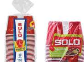
Solo Plastic Cups Selected Vtys., 30 to 50-ct.