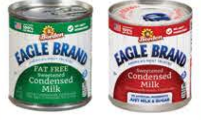
Eagle Brand Condensed Milk Selected Vtys., 14-oz.