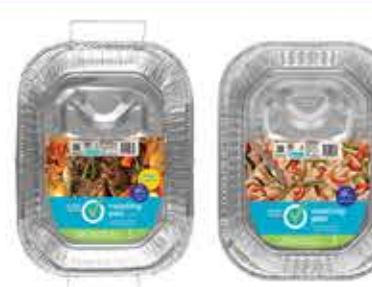
Simply Done Roasting Pans Selected Vtys., 1-ct.