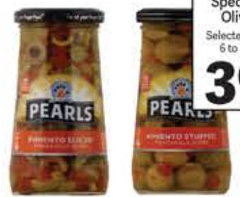
Pearls Manzanilla Olives Selected Vtys., 5.75-oz.