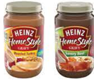
Heinz HomeStyle Gravy Selected Vtys., 12-oz.