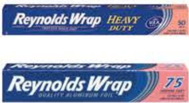
Reynolds Wrap Aluminum Foil Selected Vtys., 50 to 75-Sq. Ft.