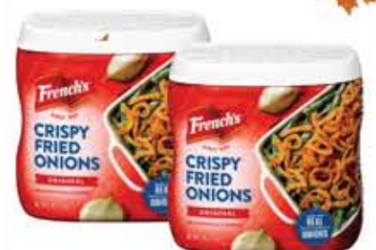
French's Crispy Fried Onions 6-oz. Original