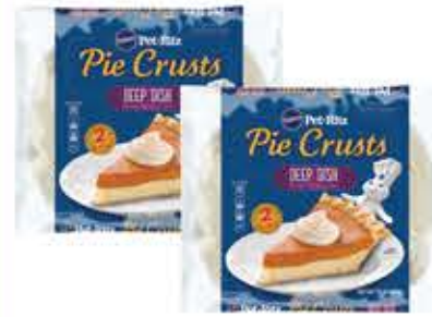
Pillsbury Deep Dish Pie Crusts 2-ct., 12-oz., Frozen