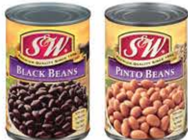
S&W Beans Selected Vtys., 15 to 15.5-oz.