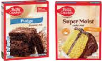
Betty Crocker Brownie or Cake Mix Selected Vtys., 13.25 to 16.3-oz.