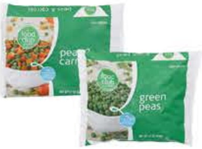
Food Club Vegetables Selected Vtys., 12-oz., Frozen