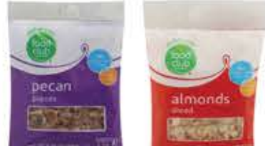
Food Club Nuts Selected Vtys., 2.25-oz.