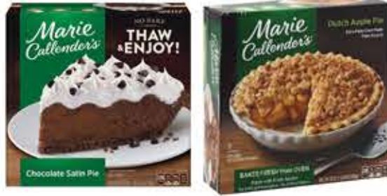
Marie Callender's Frozen Pie Selected Vtys., 24.5 to 40-oz.