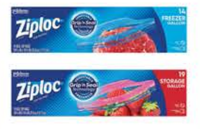
Ziploc Storage or Freezer Bags Selected Vtys., 19 to 24-ct.