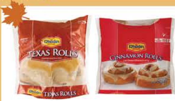
Rhodes Frozen Rolls Selected Vtys., 19 to 48-oz.