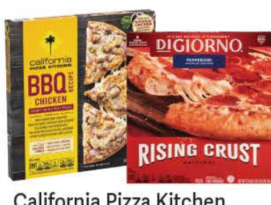
California Pizza Kitchen or DiGiorno Frozen Pizza Selected Vtys., 13.4 to 31.5-oz.