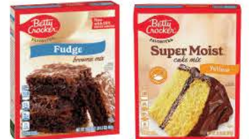
Betty Crocker Brownie or Cake Mix Selected Vtys., 13.25 to 16.3-oz.