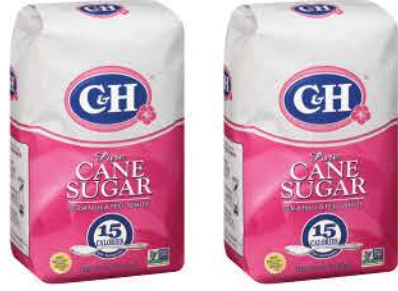
C&H Pure Cane Sugar Granulated White 4-lbs.