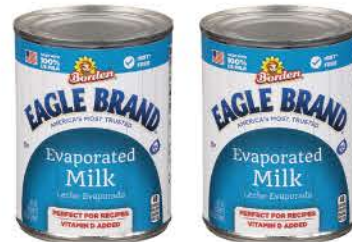
Eagle Brand Evaporated Milk 12-oz.