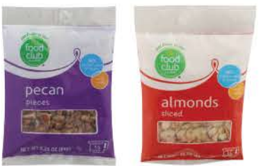
Food Club Nuts Selected Vtys., 2.25-oz.