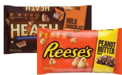
Hershey's Baking Chips Selected Vtys., 8 to 12-oz.