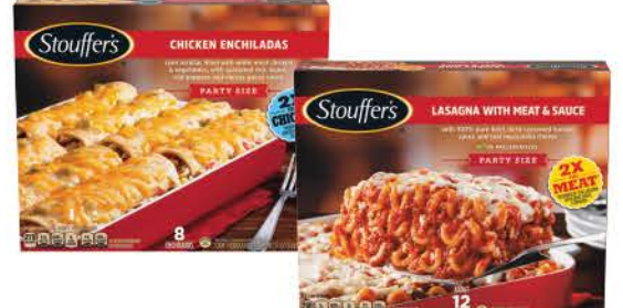
Stouffer's Party Size Entrées Selected Vtys., 57 to 96-oz., Frozen