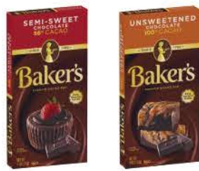
Baker's Chocolate Bars Selected Vtys., 4-oz.