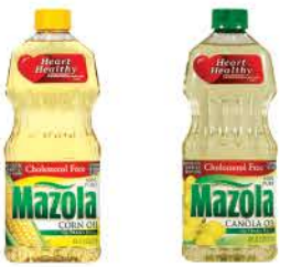
Mazola Oil Selected Vtys., 40-oz.