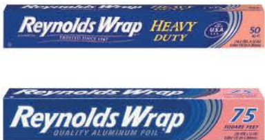
Reynolds Wrap Aluminum Foil Selected Vtys., 50 to 75-Sq. Ft.