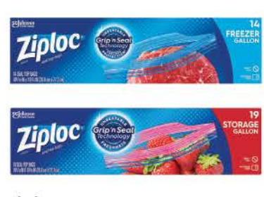
Ziploc Storage or Freezer Bags Selected Vtys., 19 to 24-ct.