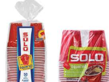
Solo Plastic Cups Selected Vtys., 30 to 50-ct.