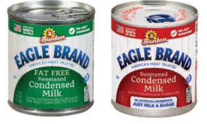
Eagle Brand Condensed Milk Selected Vtys., 14-oz.