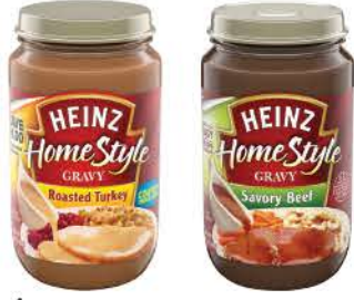
Heinz HomeStyle Gravy Selected Vtys., 12-oz.