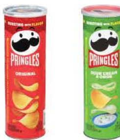
Pringles Potato Crisps Selected Vtys., 5.2 to 5.6-oz.