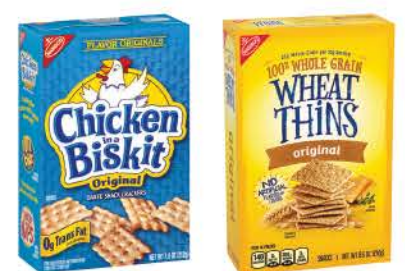
Nabisco Snack Crackers Selected Vtys., 6.5 to 8.5-oz.