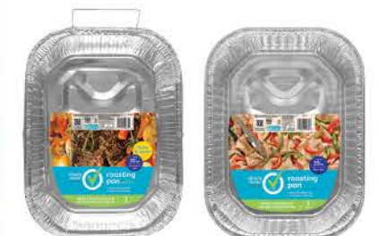
Simply Done Roasting Pans Selected Vtys., 1-ct.