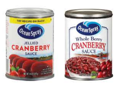
Ocean Spray Cranberry Sauce Whole Berry or Jellied 14-oz.