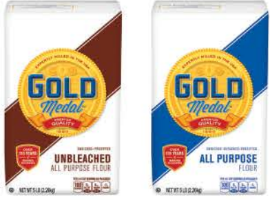
Gold Medal All Purpose Flour Bleached or Unbleached 5-lbs.