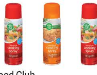
Food Club Non-Stick Cooking Spray Selected Vtys., 5 to 6-oz.