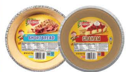
Keebler Pie Crusts Selected Vtys., 1 to 4-ct.