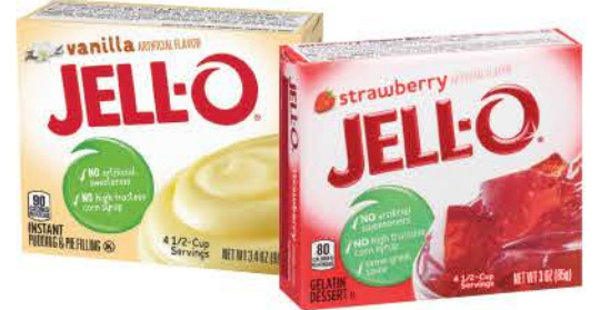
Jell-O Pudding or Gelatin Mix Selected Vtys., .9 to 3.9-oz.