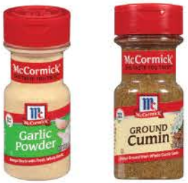
McCormick Spices or Extracts Selected Vtys., .12 to 4.12-oz.