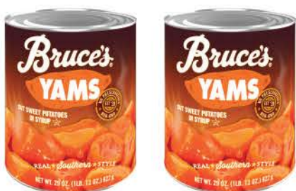
Bruce's Cut Yams 29-oz. In Syrup