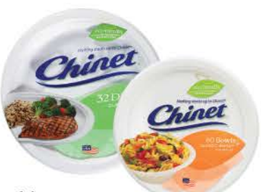
Chinet Paper Plates, Bowls or Trays Selected Vtys., 24 to 70-ct.