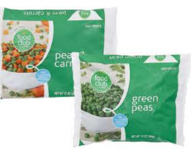
Food Club Vegetables Selected Vtys., 12-oz., Frozen