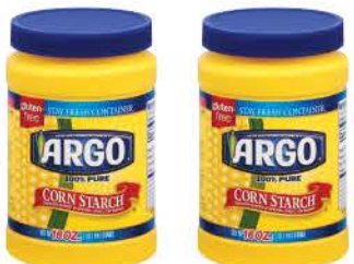
Argo Corn Starch 16-oz.