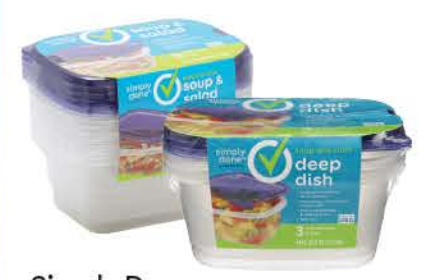
Simply Done Food Storage Containers Selected Vtys., 2 to 6-ct.