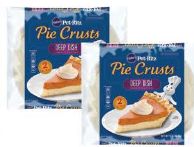
Pillsbury Deep Dish Pie Crusts 2-ct., 12-oz., Frozen