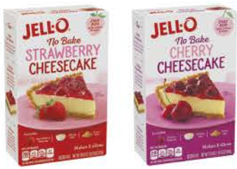
Jell-O No Bake Cheesecake Selected Vtys., 17.8 to 19.6-oz.