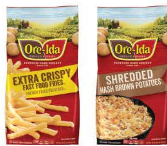
Ore-Ida Frozen Potatoes Selected Vtys., 19 to 32-oz.