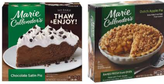
Marie Callender's Frozen Pie Selected Vtys., 24.5 to 40-oz.