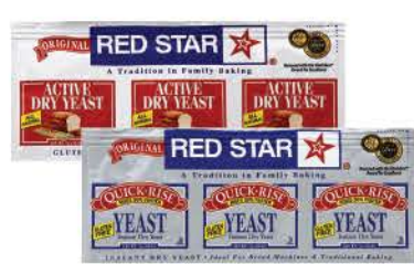
Red Star Yeast Selected Vtys., 3-ct.