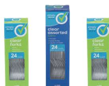
Simply Done Cutlery Selected Vtys., 24-ct.