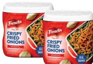
French's Crispy Fried Onions 6-oz. Original