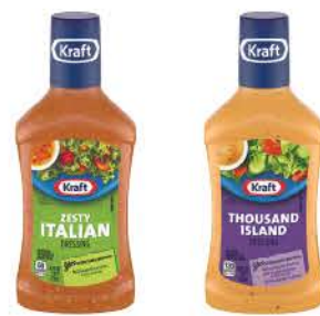
Kraft Salad Dressing Selected Vtys., 16-oz.