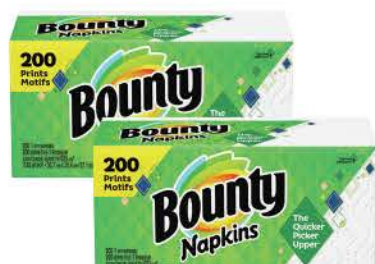
Bounty White Napkins 200-ct.