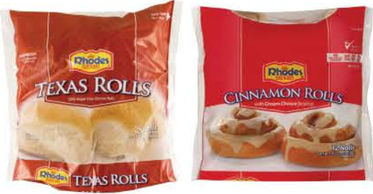
Rhodes Frozen Rolls Selected Vtys., 19 to 48-oz.