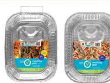
Simply Done Roasting Pans Selected Vtys., 1-ct.