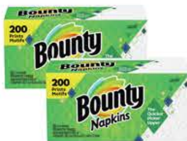
Bounty White Napkins 200-ct.