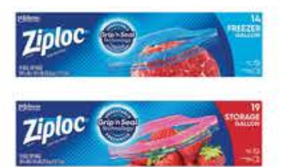
Ziploc Storage or Freezer Bags Selected Vtys., 19 to 24-ct.