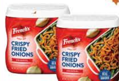
French's Crispy Fried Onions 6-oz. Original