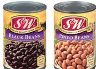
S&W Beans Selected Vtys., 15 to 15.5-oz.