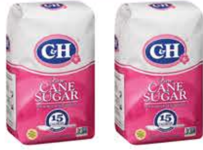
C&H Pure Cane Sugar Granulated White 4-lbs.