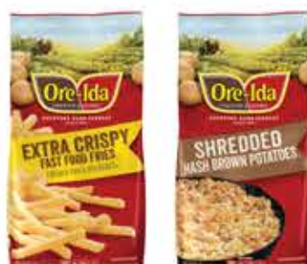
Ore-Ida Frozen Potatoes Selected Vtys., 19 to 32-oz.