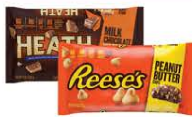
Hershey's Baking Chips Selected Vtys., 8 to 12-oz.