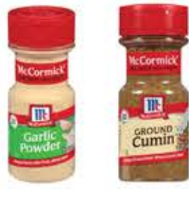
McCormick Spices or Extracts Selected Vtys., 12 to 4.12-oz.