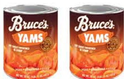
Bruce's Cut Yams 29-oz. In Syrup