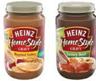
Heinz HomeStyle Gravy Selected Vtys., 12-oz.