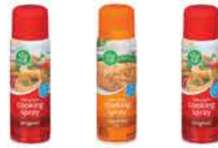
Food Club Non-Stick Cooking Spray Selected Vtys., 5 to 6-oz.