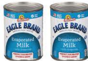
Eagle Brand Evaporated Milk 12-oz.