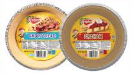
Keebler Pie Crusts Selected Vtys., 1 to 4-ct.