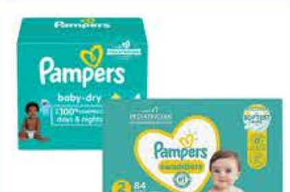
Pampers Diapers Selected Vtys., 44 to 96-ct.