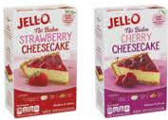
Jell-O No Bake Cheesecake Selected Vtys., 17.8 to 19.6-oz.