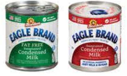
Eagle Brand Condensed Milk Selected Vtys., 14-oz.