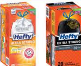
Hefty Trash Bags Selected Vtys., 28 to 45-ct.