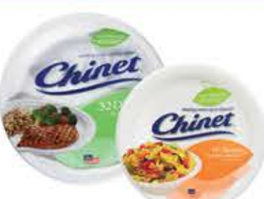
Chinet Paper Plates, Bowls or Trays Selected Vtys., 24 to 70-ct.