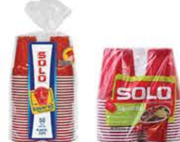
Solo Plastic Cups Selected Vtys., 30 to 50-ct.