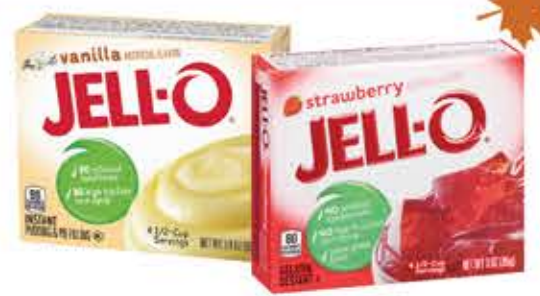
Jell-O Pudding or Gelatin Mix Selected Vtys., 9 to 3.9-oz.