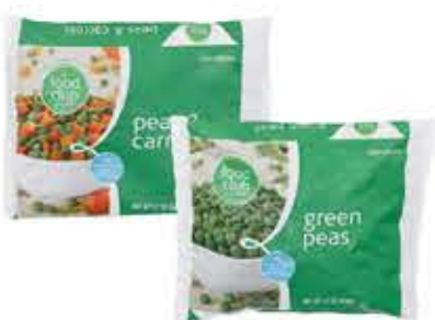
Food Club Vegetables Selected Vtys., 12-oz., Frozen