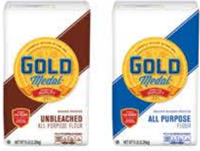
Gold Medal All Purpose Flour Bleached or Unbleached 5-lbs.