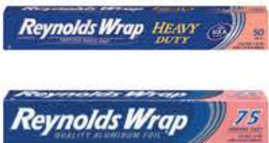
Reynolds Wrap Aluminum Foil Selected Vtys., 50 to 75-Sq. Ft.