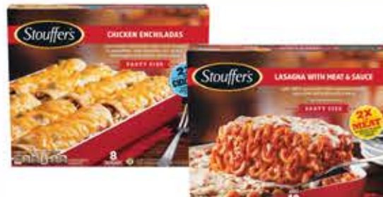
Stouffer's Party Size Entrées Selected Vtys., 57 to 96-oz., Frozen