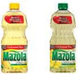
Mazola Oil Selected Vtys., 40-oz.