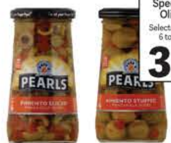
Pearls Manzanilla Olives Selected Vtys., 5.75-oz.