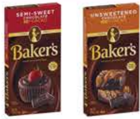
Baker's Chocolate Bars Selected Vtys., 4-oz.