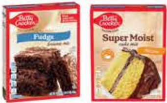
Betty Crocker Brownie or Cake Mix Selected Vtys., 13.25 to 16.3-oz.