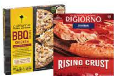
California Pizza Kitchen or DiGiorno Frozen Pizza Selected Vtys., 13.4 to 31.5-oz.