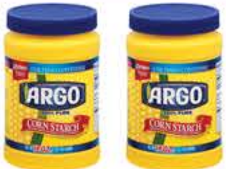
Argo Corn Starch 16-oz.