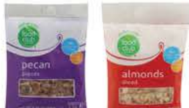
Food Club Nuts Selected Vtys., 2.25-oz.