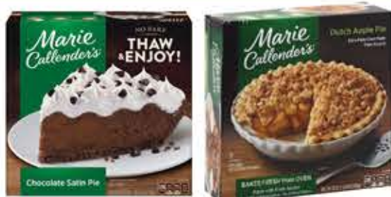
Marie Callender's Frozen Pie Selected Vtys., 24.5 to 40-oz.