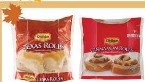
Rhodes Frozen Rolls Selected Vtys., 19 to 48-oz.