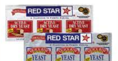
Red Star Yeast Selected Vtys., 3-ct.