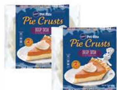
Pillsbury Deep Dish Pie Crusts 2-ct., 12-oz., Frozen