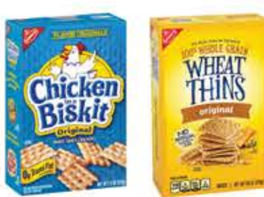
Nabisco Snack Crackers Selected Vtys., 6.5 to 8.5-oz.