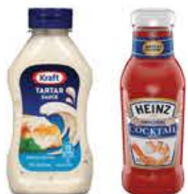
Kraft or Heinz Sauce Selected Vtys., 12-oz.