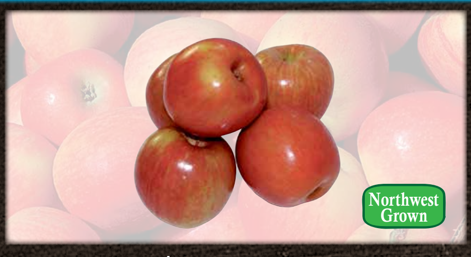
TABLE PRINCIPAL INC.

~ A Local Employee-Owned Company • Established in 1946 ~