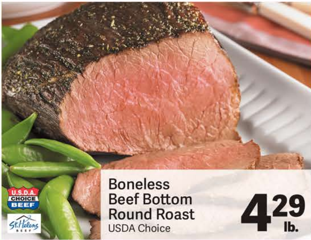
Boneless Beef Bottom Round Roast USDA Choice