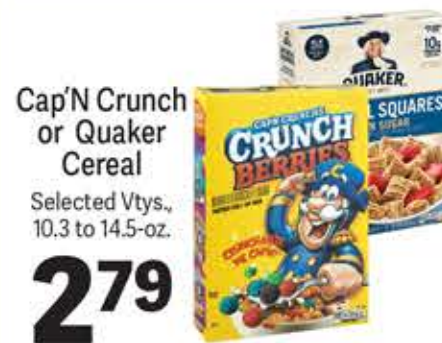
Cap'n Crunch or Quaker Cereal Selected Vtys., 10.3 to 14.5-oz.