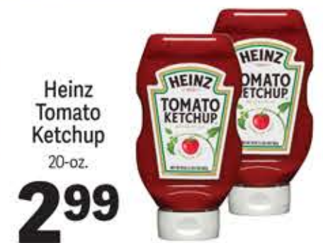
Heinz Tomato Ketchup 20-oz.