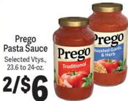
Prego Pasta Sauce Selected Vtys., 23.6 to 24-oz.