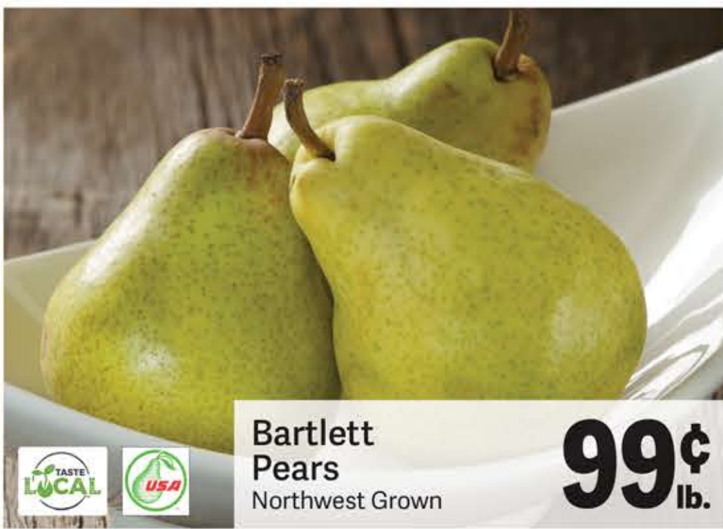
Bartlett Pears Northwest Grown