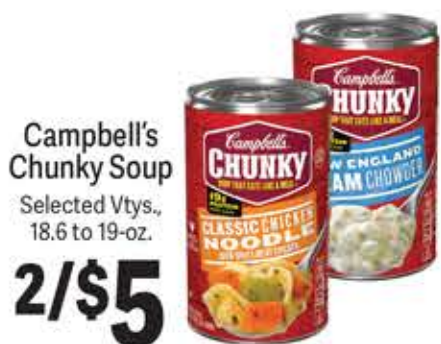
Campbell's Chunky Soup Selected Vtys., 18.6 to 19-oz.