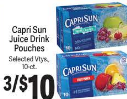
Capri Sun Juice Drink Pouches Selected Vtys., 10-ct.