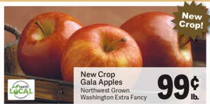
New Crop Gala Apples Northwest Grown Washington Extra Fancy