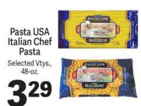
Pasta USA Italian Chef Pasta Selected Vtys., 48-oz.