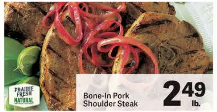
Bone-In Pork Shoulder Steak