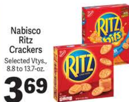
Nabisco Ritz Crackers Selected Vtys., 8.8 to 13.7-oz.