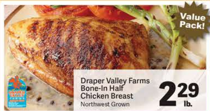
Draper Valley Farms Bone-In Half Chicken Breast Northwest Grown