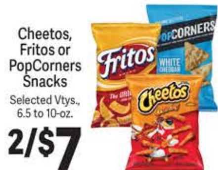
Cheetos, Fritos or PopCorners Snacks Selected Vtys., 6.5 to 10-oz.