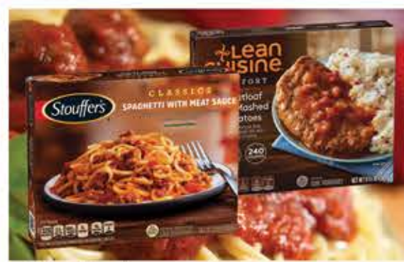
Stouffer's or Lean Cuisine Frozen Dinners Selected Vtys., 6 to 12.8-oz.