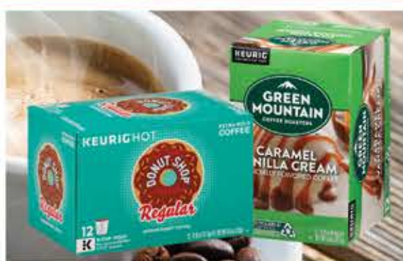
Donut Shop or Green Mountain K-Cup Pods Selected Vtys., 10 to 12-ct.