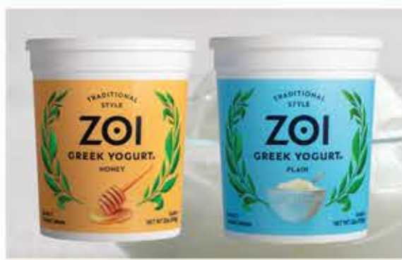
Zoi Greek Yogurt Selected Vtys., 32-oz.