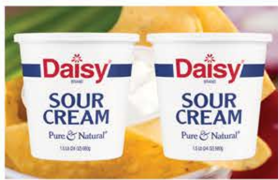
Daisy Pure & Natural Sour Cream 24-oz.