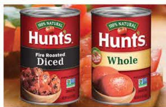
Hunt's Diced or Whole Tomato Selected Vtys., 14.5-oz.