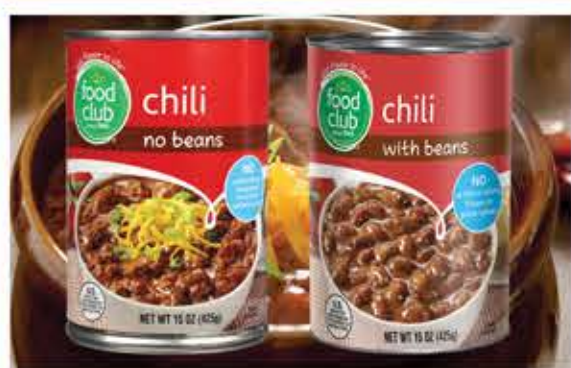
Food Club Chili Selected Vtys., 15-oz.