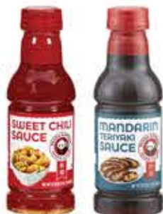
Panda Express Sauce Selected Vtys., 20.5 to 20.7-oz.