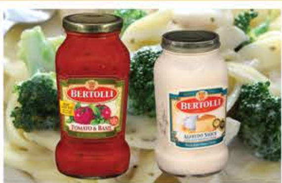
Bertolli Pasta Sauce Selected Vtys., 15 to 24-oz.