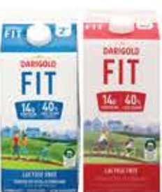
Darigold Fit Milk Selected Vtys., 59-oz.