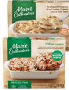
Marie Callender's Meal For Two Lasagna or Scalloped Potatoes 27 to 31-oz., Frozen