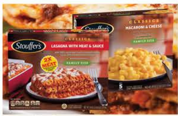
Stouffer's Family Size Dinners Selected Vtys., 30 to 40-oz., Frozen