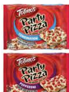
Totino's Party Pizza Selected Vtys., 9.8 to 10.9-oz., Frozen