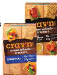
Crav'n Flavor Woven Wheats Crackers Selected Vtys., 9-oz.