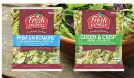
Fresh Express Premium Garden Salad Selected Vtys., 9 to 11-oz.