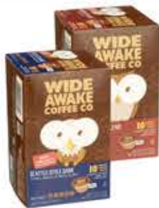
Wide Awake Coffee Co. K-Cup Pods Selected Vtys., 10-ct.