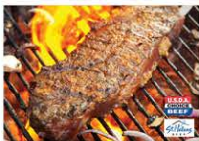
Boneless Beef New York Steak USDA Choice