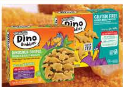
Yummy Dino Buddies Chicken Nuggets Selected Vtys., 18 to 21.5-oz., Frozen