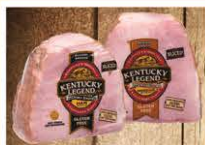
Kentucky Legend Boneless Ham