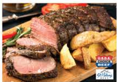
Boneless Beef Sirloin Tip Roast USDA Choice