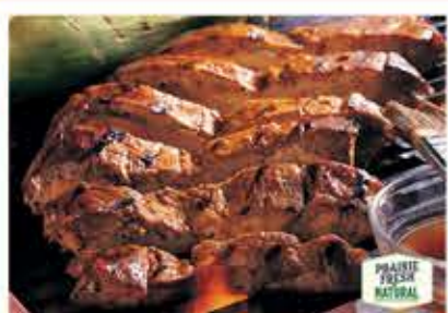
Boneless Pork Country Style Ribs