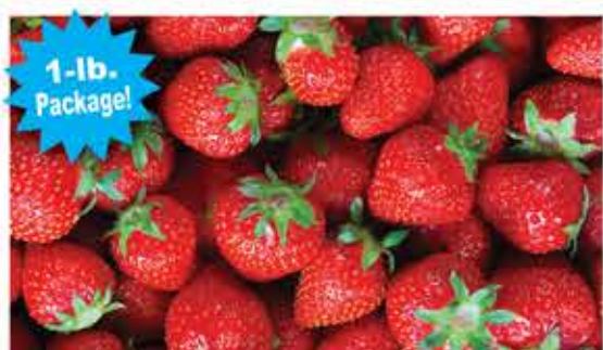
Strawberries 1-lb. Package