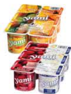
Yami Yogurt Selected Vtys., 6-ct.