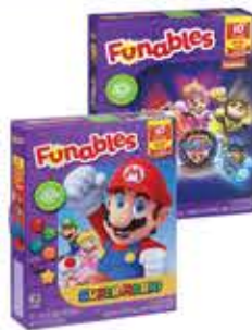
Funables Fruit Snacks Selected Vtys., 10-ct.