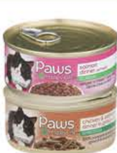
Paws Happy Life Canned Cat Food Selected Vtys., 5.5-oz.