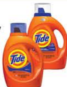
Tide Liquid Laundry Detergent Selected Vtys., 92-oz.