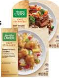
Healthy Choices Café Steamers Selected Vtys., 9.5 to 11-oz., Frozen