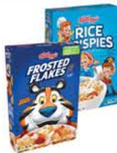
Kellogg's Cereal Selected Vtys., 9 to 15.5-oz.