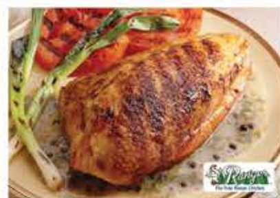
Ranger Free Range Bone-In Half Chicken Breast Northwest Grown