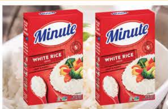
Minute White Rice 28-oz.