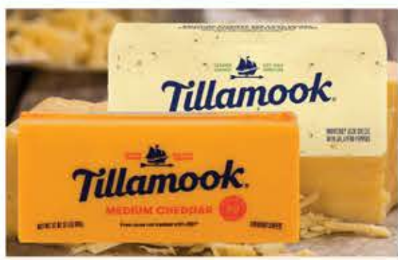
Tillamook Cheese Selected Vtys., 2-lb. Loaf