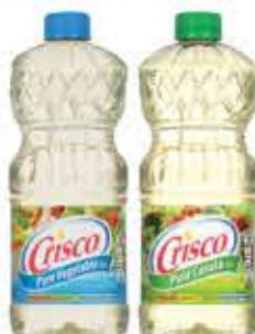
Crisco Pure Oil Vegetable or Canola 40-oz.