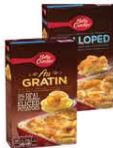
Betty Crocker Potatoes Selected Vtys., 4.7 to 5.1-oz.