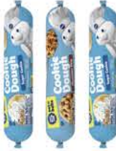
Pillsbury Cookie Dough Selected Vtys., 16.5-oz.