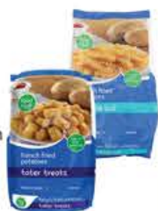
Food Club Potatoes Selected Vtys., 22.5 to 32-oz., Frozen