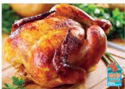
Draper Valley Farms Whole Chicken Northwest Grown