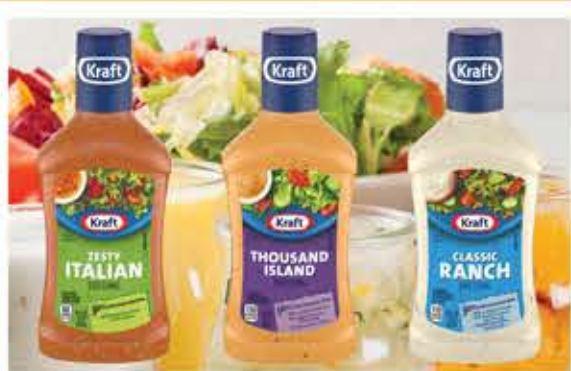
Kraft Dressing Selected Vtys., 16-oz.