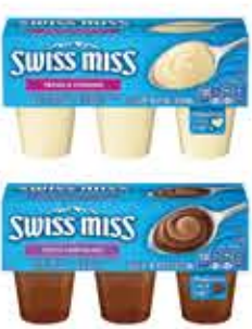
Swiss Miss Pudding Cups Selected Vtys., 6-ct.