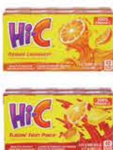
Hi-C Fruit Drink Selected Vtys., 8-ct.