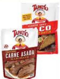
Tapatio Marinade or Sauce Selected Vtys., 8-oz.