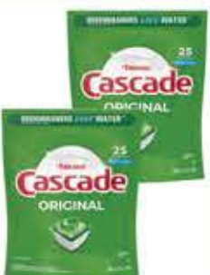
Cascade Original ActionPacs Dishwasher Detergent 25-ct.