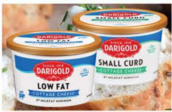
Darigold Cottage Cheese Selected Vtys., 16-oz.