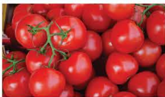
On The Vine Tomatoes