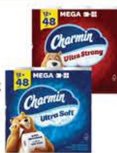
Charmin Bath Tissue Ultra Soft or Strong 12-Mega Rolls