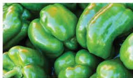
Large Green Bell Peppers