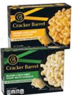
Cracker Barrel Macaroni & Cheese Dinner Selected Vtys., 14-oz.