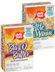
Jolly Time Microwave Popcorn Selected Vtys., 3-ct.