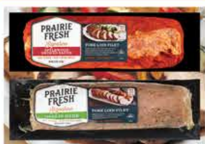
Prairie Fresh Signature Pork Loin Filet Selected Vtys., 27.2-oz.