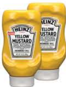
Heinz Mustard 14-oz.