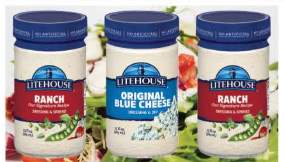
Litehouse Dressing Selected Vtys., 13-oz.