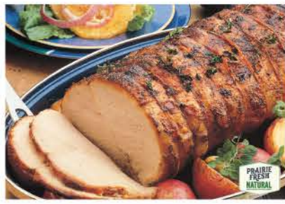
Boneless Pork Tenderloin Roast