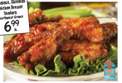
Draper Valley Farms Chicken Wings Northwest Grown

Free Range Boneless, Skinless Chicken Breast Tenders Northwest Grown 6 99 lb.