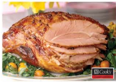
Cook's Bone-In Shank Portion Ham