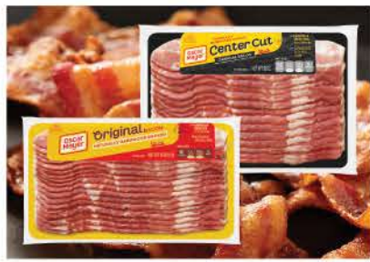
Oscar Mayer Bacon Original or Center Cut 12 to 16-oz.