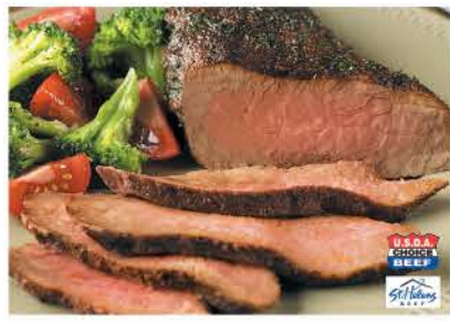
Boneless Beef Tri Tip Roast USDA Choice