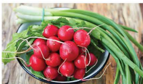
Radishes or Green Onions