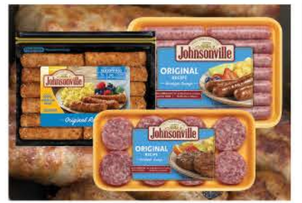
Johnsonville Breakfast Sausage Selected Vtys., 9.6 to 16-oz., Frozen