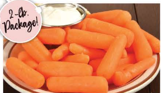
Peeled Mini Carrots 2-lb. Package