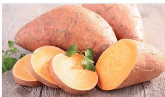
Yams U.S. #1