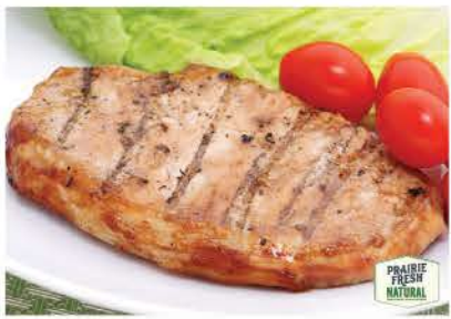
Boneless Pork Loin Chops