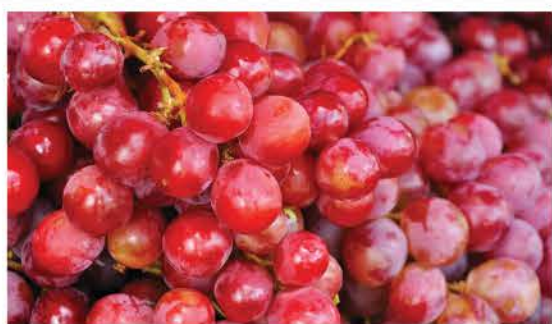
Red Seedless Grapes