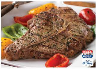
Bone-In Beef T-Bone Steak USDA Choice