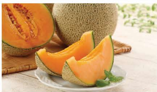
Sweet, Ripe Cantaloupe