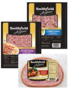
Smithfield Prime Fresh Lunchmeat Selected Vtys., 7 to 8-oz.